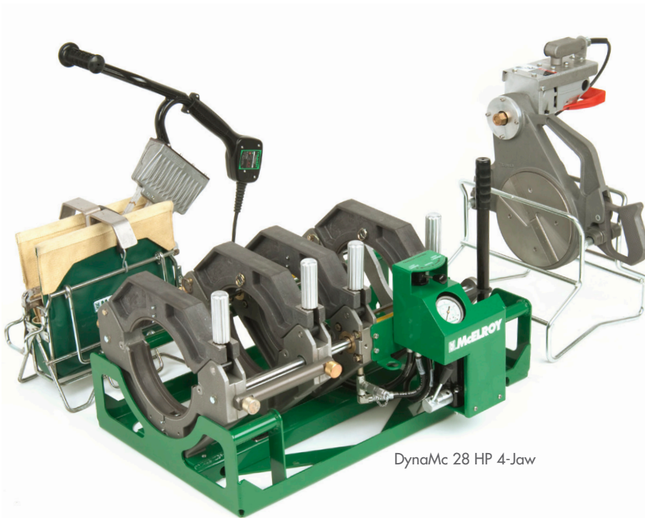
DynaMc 28 HP 4-Jaw

Fusion Capability for 2" IPS to 8" DIPS (63mm - 225mm)