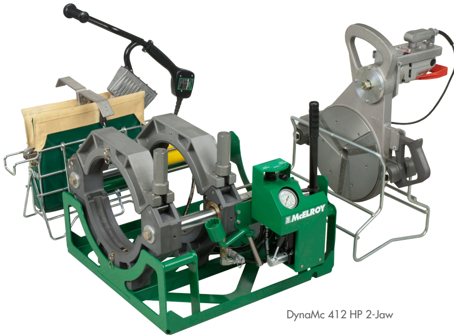
DynaMc 412 HP 2-Jaw

Fusion Capability for 4" IPS — 12" DIPS (110mm — 340mm)