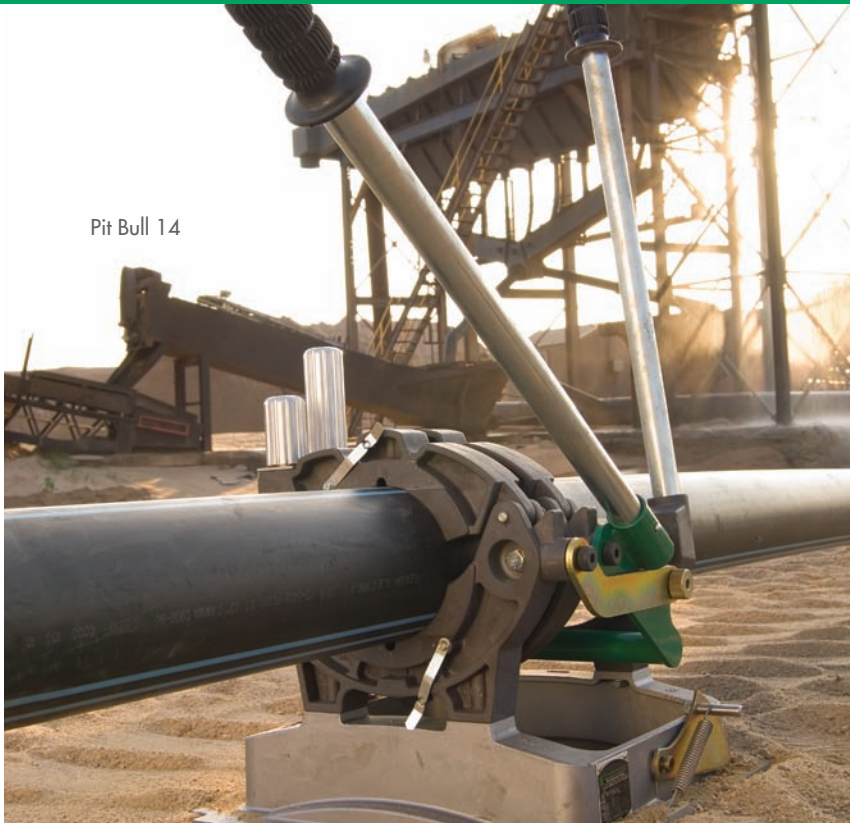
Pit Bull 14

Fusion Capability for 1" IPS to 4" DIPS (32mm - 110mm)